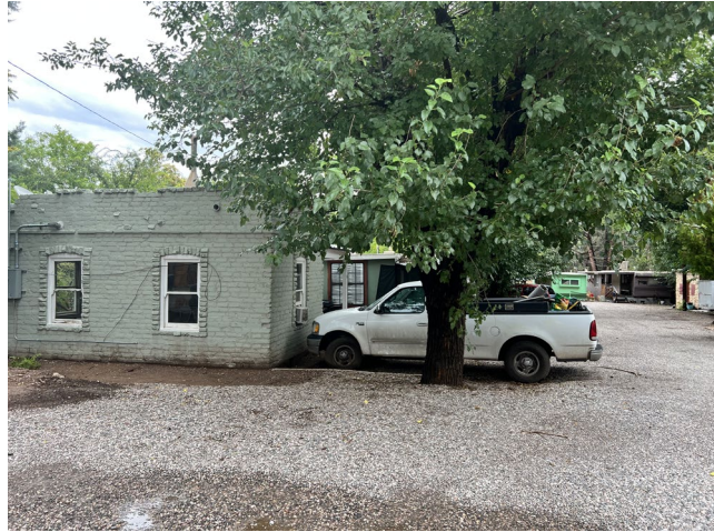
Unnamed building (left), facing southwest and Unit 1 (right)m facing east.