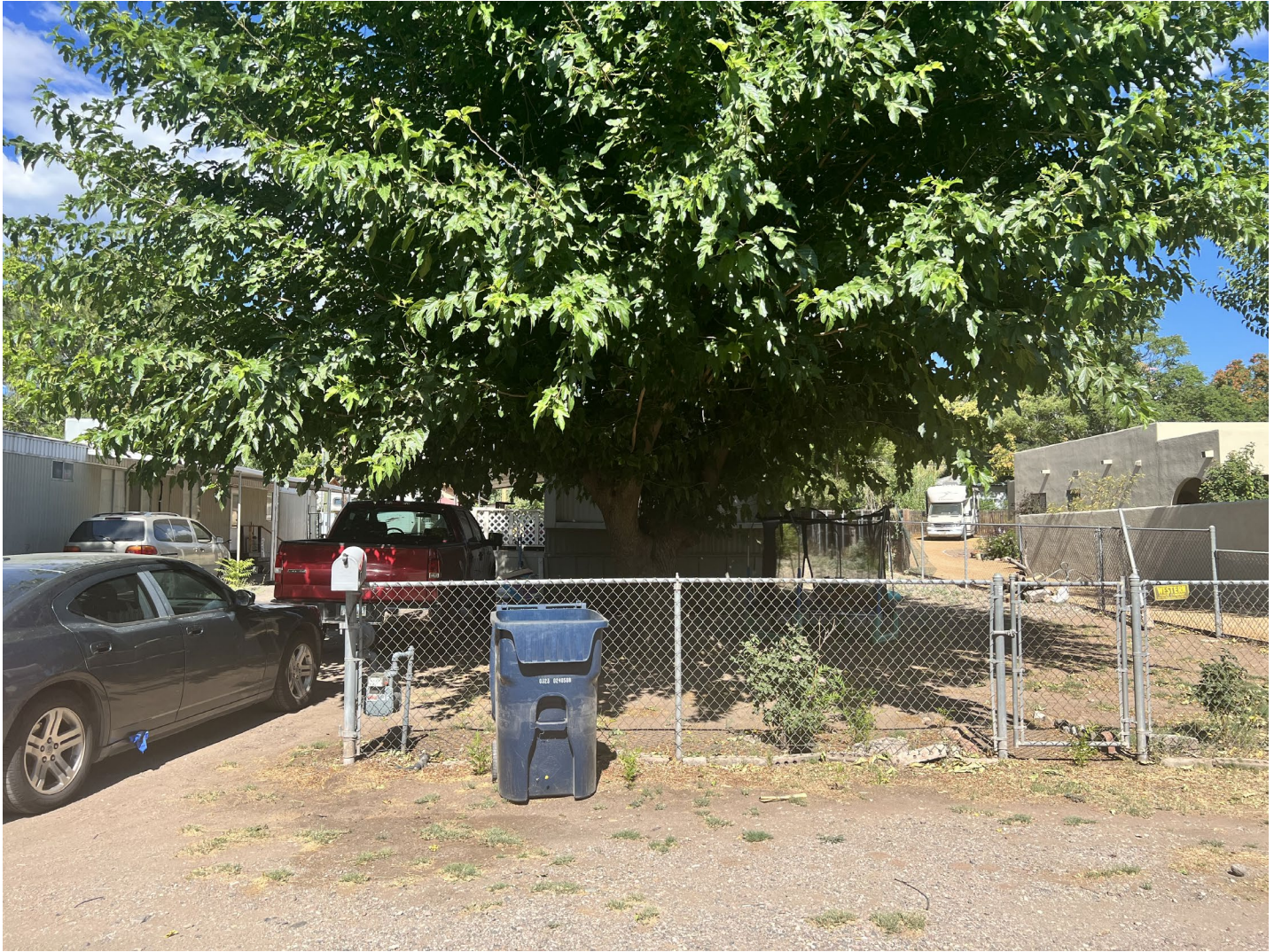
726 N. 6 th St, facing east.