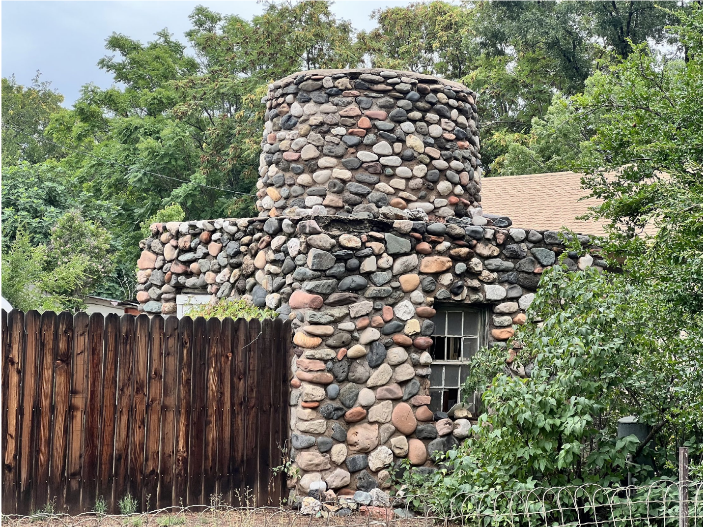
Stone kiln building, facing southeast. Photograph taken 8/18/2023.