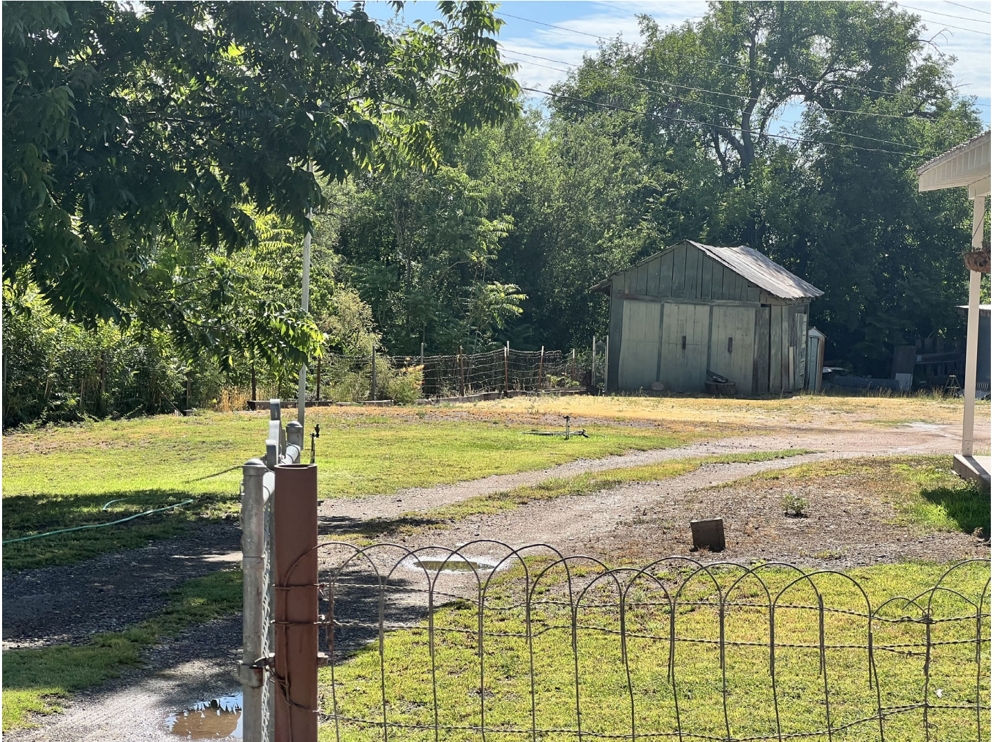
Garage/shed, facing east.