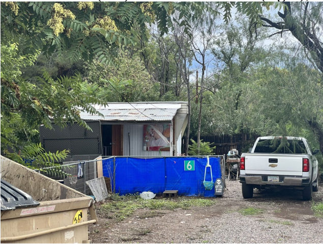
Unit 6, facing east. Photograph taken 8/18/2023. Unit 5 not shown.