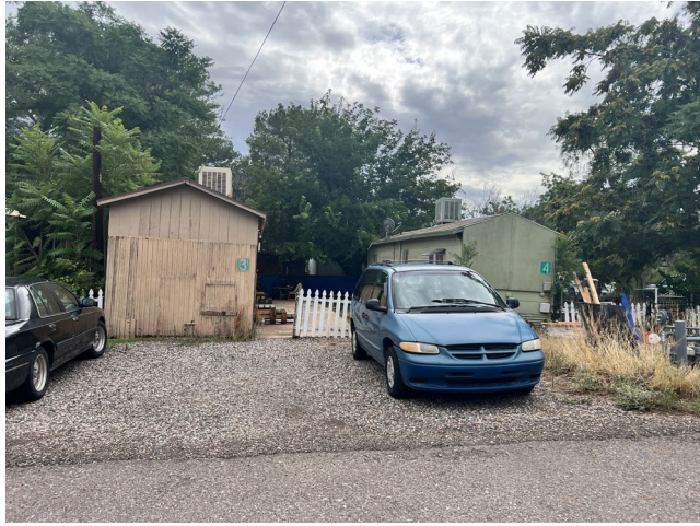
Units 1 and 2 (left) and Units 3 and 4 (right), facing east. Photographs taken 8/18/2023.