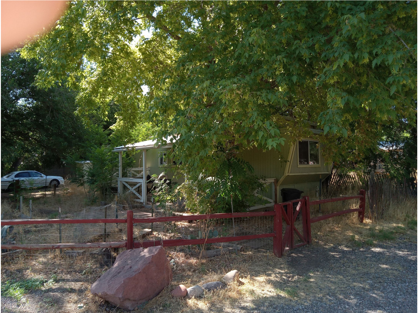
1027 N. 4 th St., facing southeast.