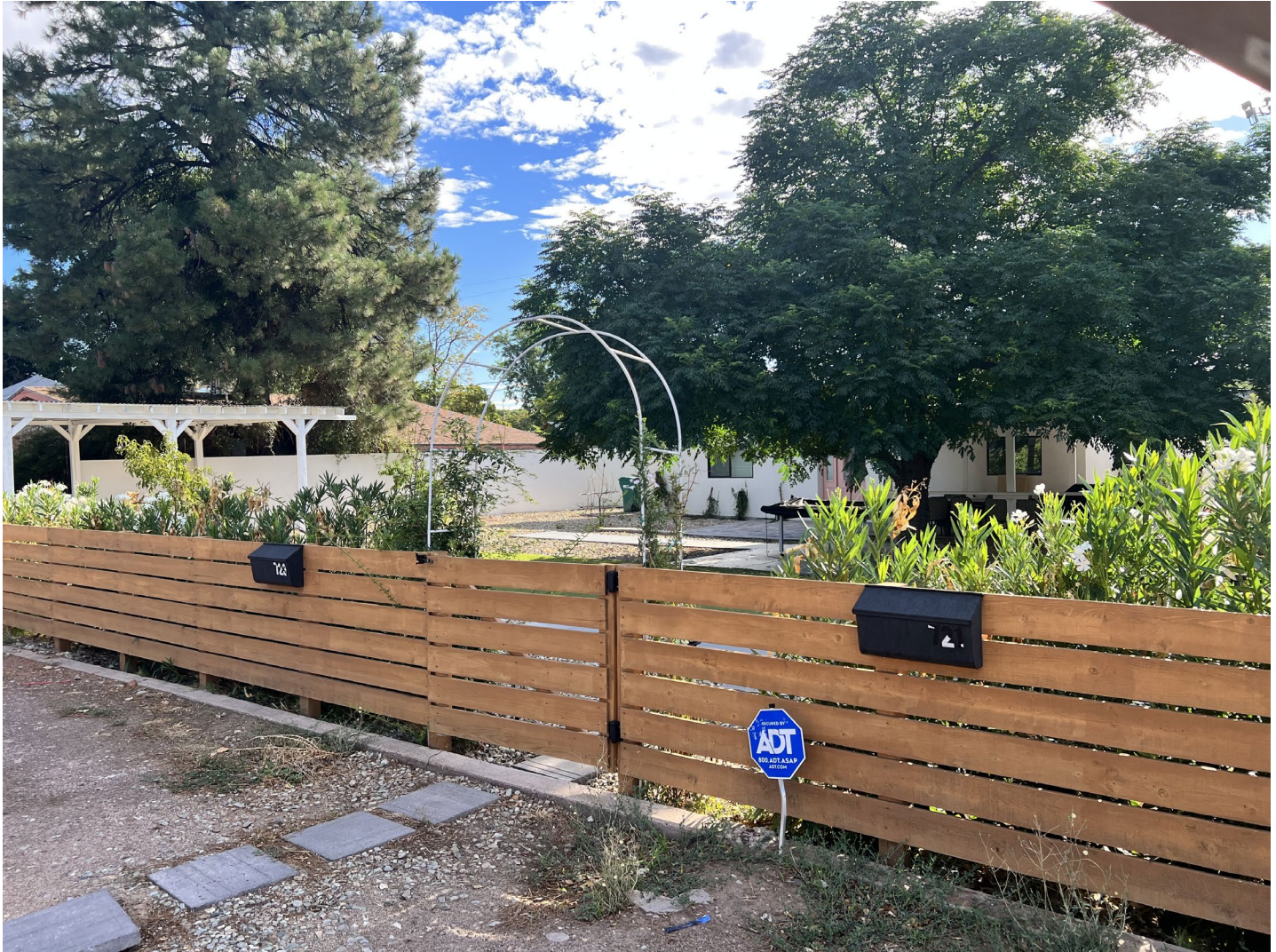
723 N. 3 rd St., facing northeast.