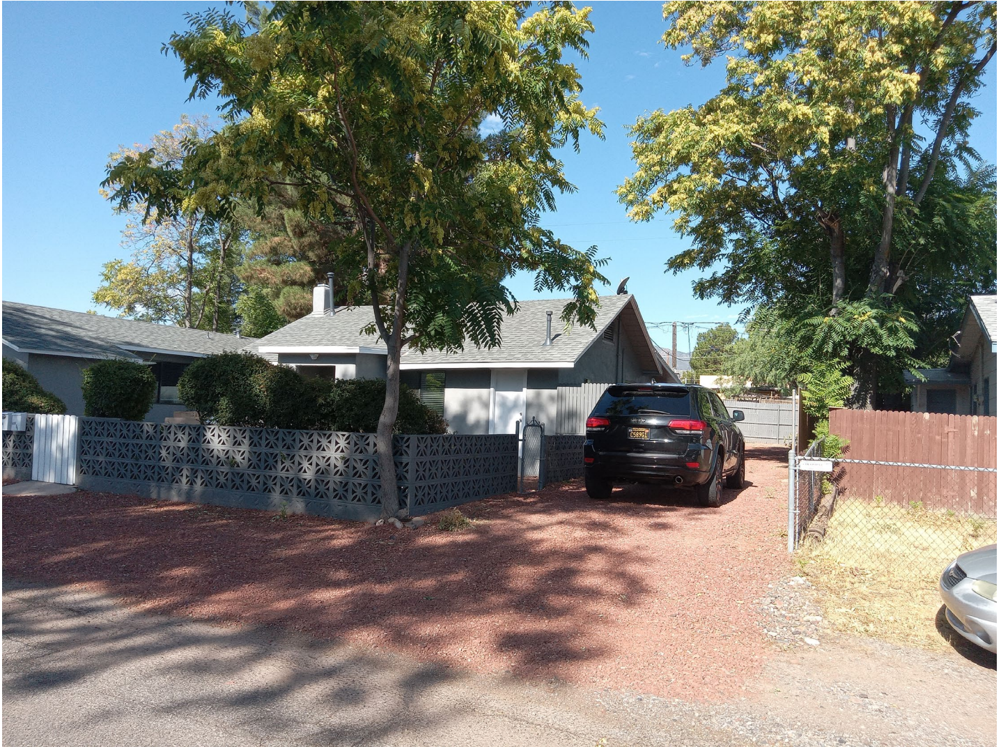
814 N. 4 th Street, facing southwest.