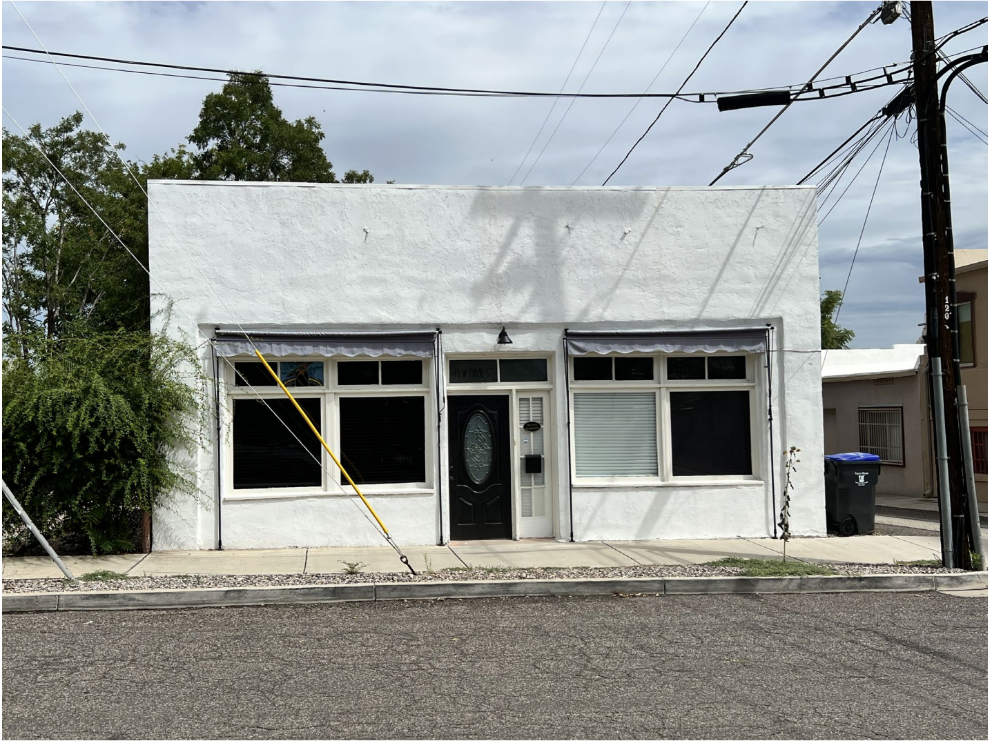
14 W. Pinal St., facing north.