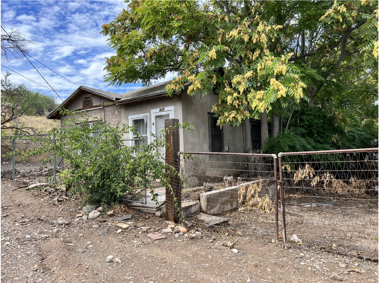
Figure 1. 970 N. Ironwood St., facing southwest.