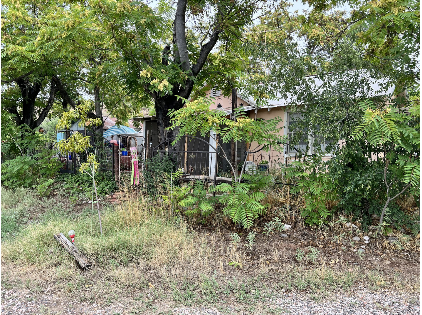
240 W. Santa Cruz, facing northwest.