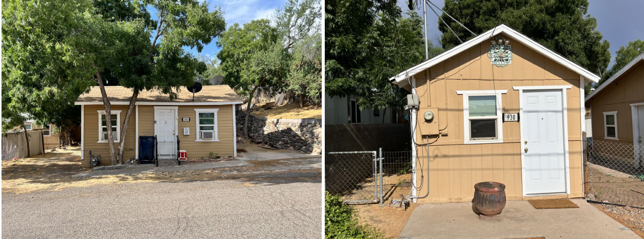
105 W. Pinal St. (left), facing south, and 930 N. Cactus St. (right), facing west